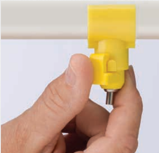
1 Remove your old Val™ or Cumberland™ nipple