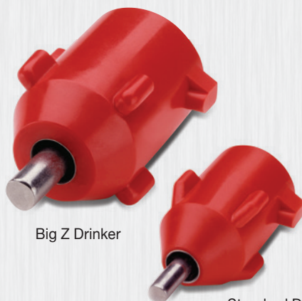
Big Z Drinker