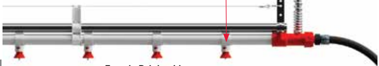
Female Drinker Line