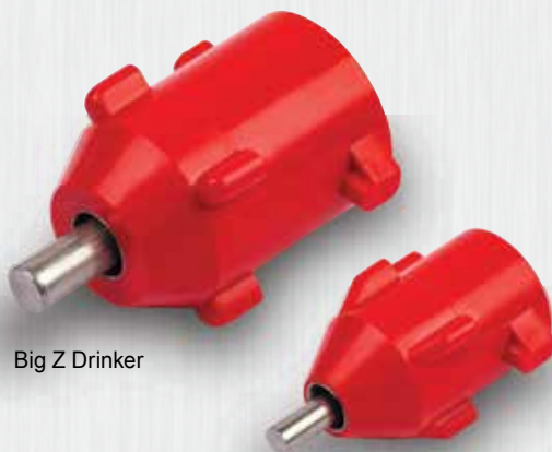
Big Z Drinker