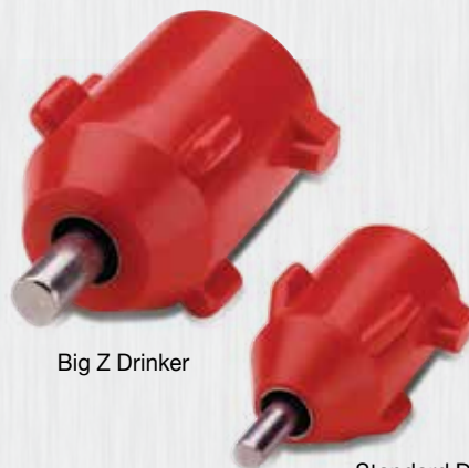
Big Z Drinker