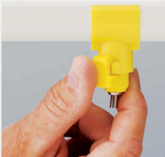
1 Remove your old Val™ or Cumberland™