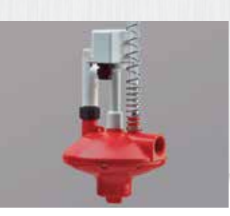
Auto Flush Regulator For automatic and unattended system flushing – requires connection to a controller or timer with a 24 VAC output.