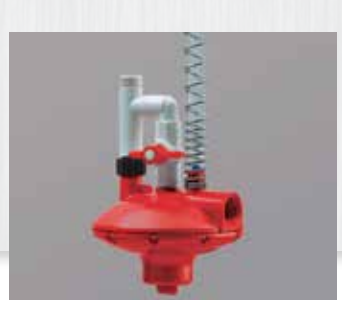
Flush Regulator Delivers high water volume at the low pressure required for no-spill drinking. Built-in flush valve makes for easy removal of sediment, biofilm and air.