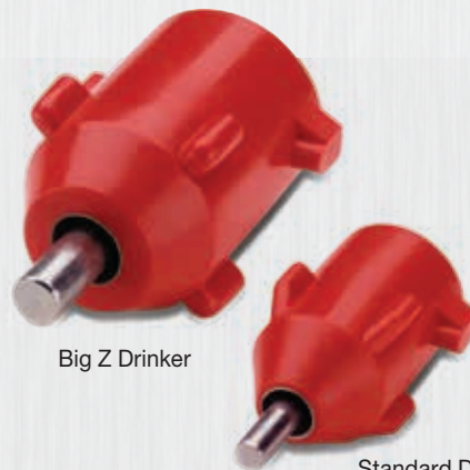
Big Z Drinker